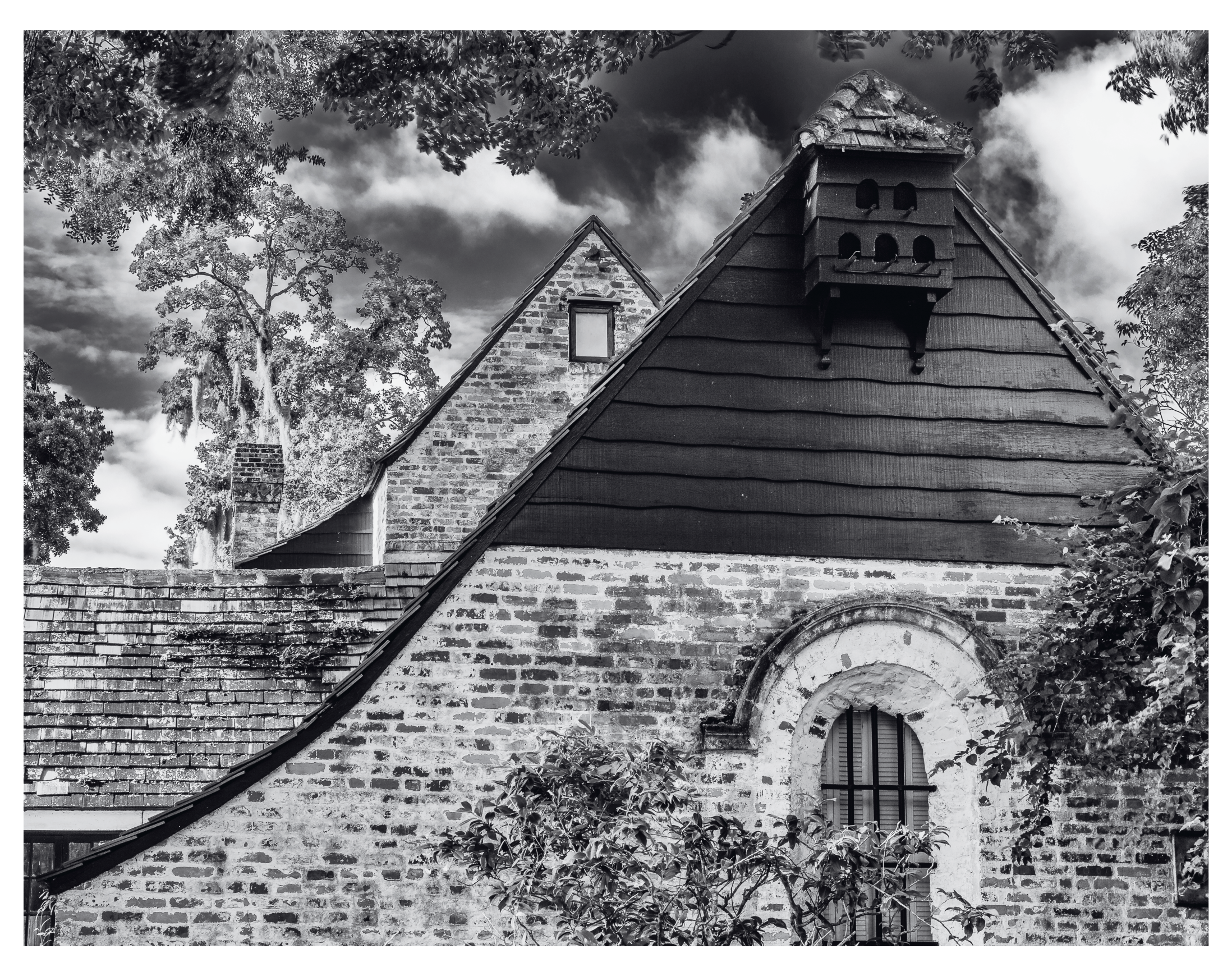
842 Laurel Avenue • Photo by Bob Egleston Built 1933