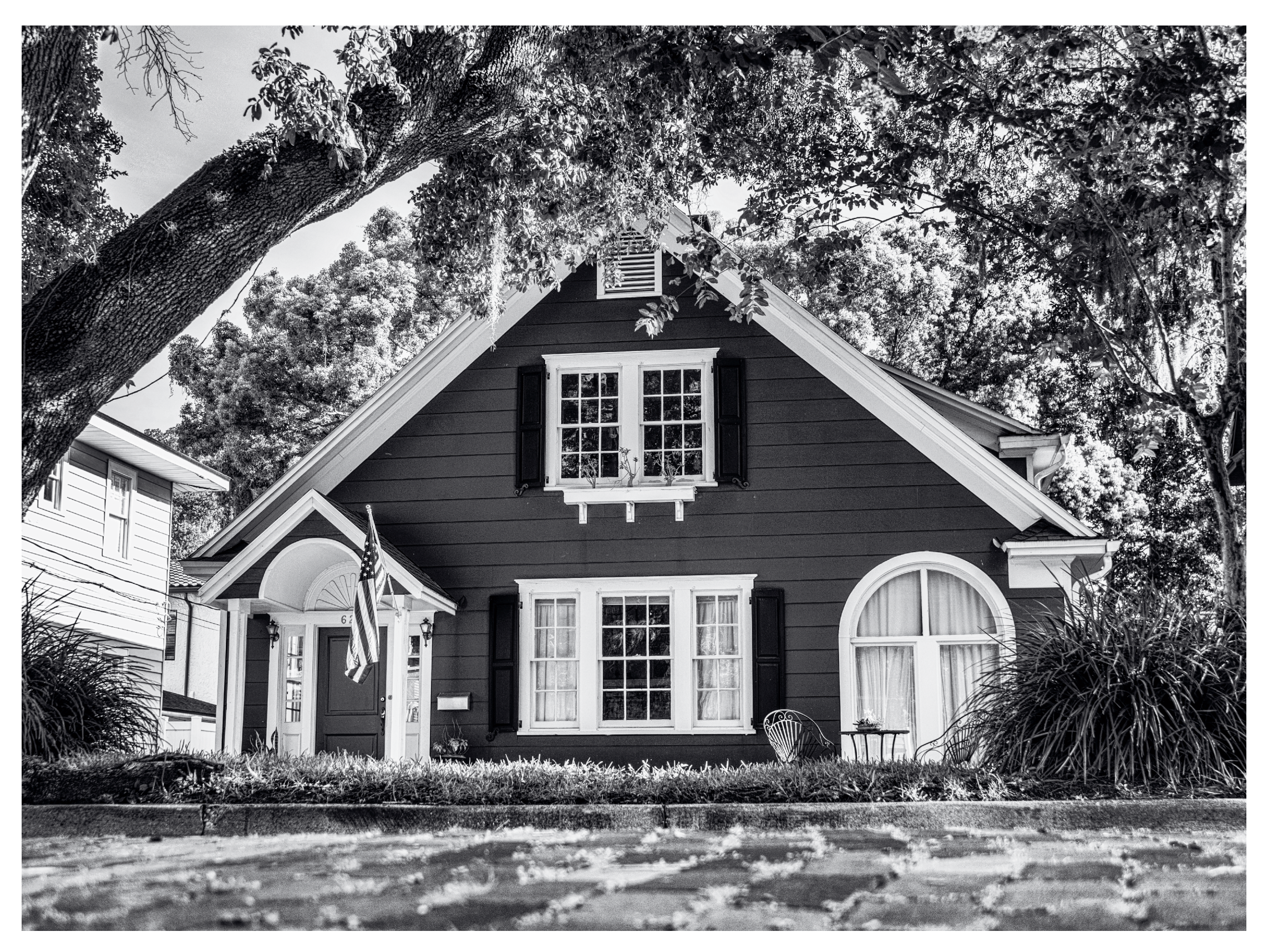
627 E Park Lake Street • Photo by Steven Madow Built 1924