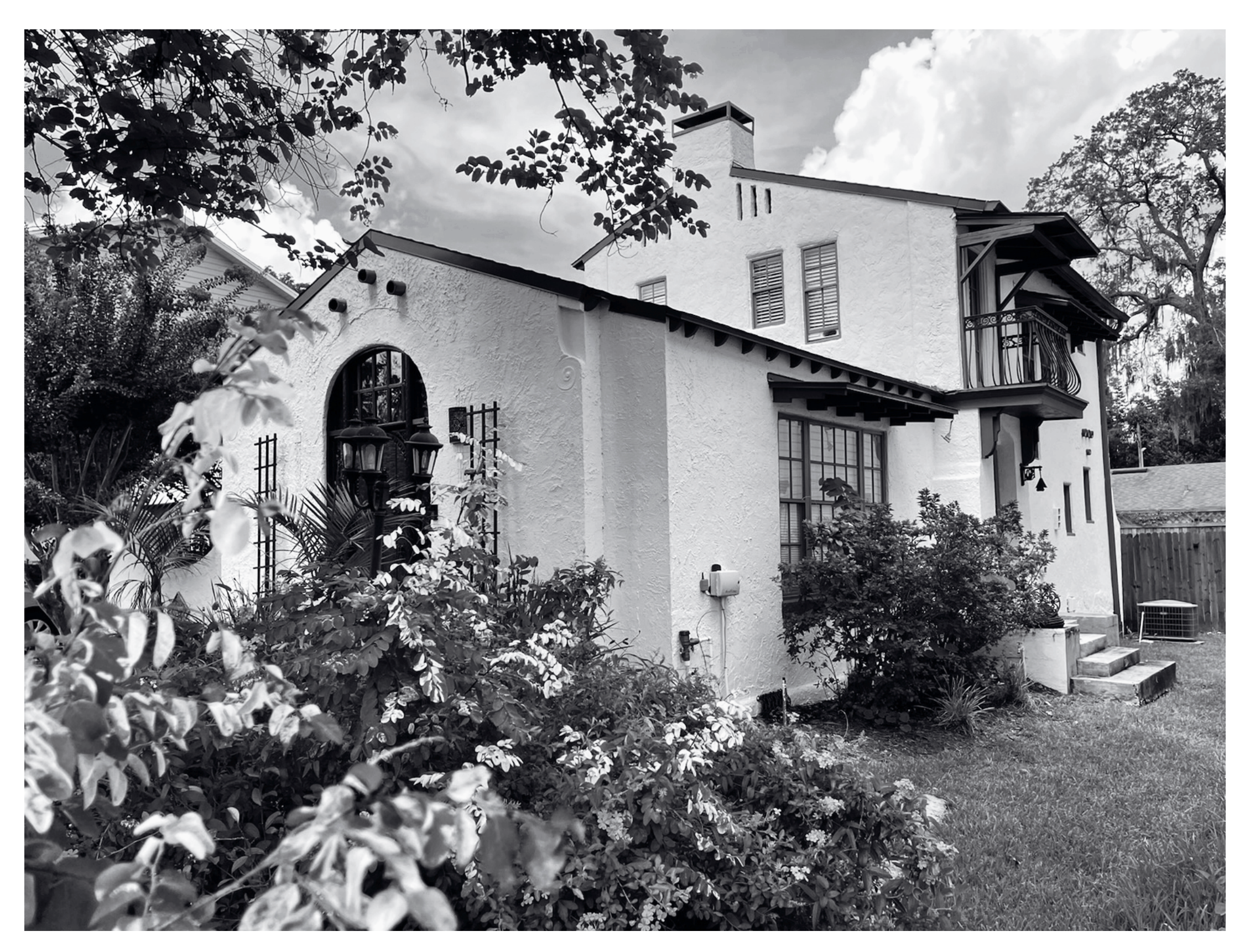
834 Kenilworth Terrace • Photo by Jane Ferry Built 1926