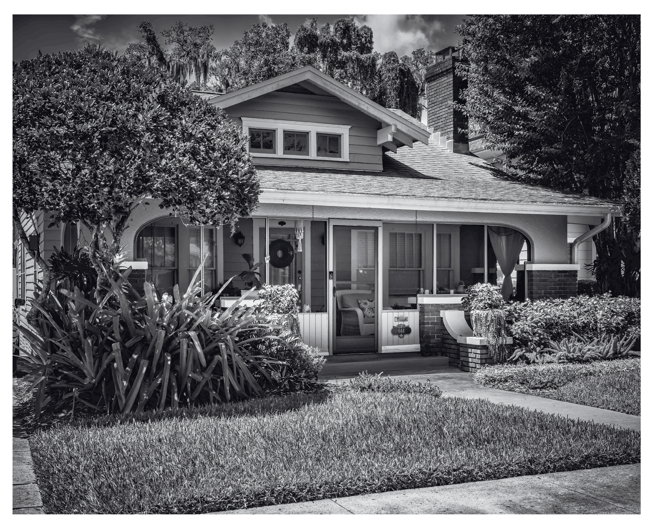
644 Park Lake Street • Photo by Kevin S Drinan Built 1923