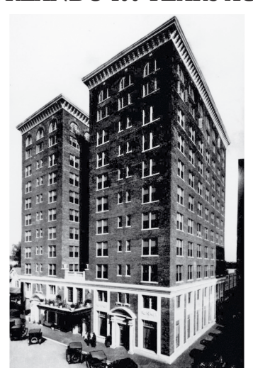
View of Angebilt Hotel circa 1923.