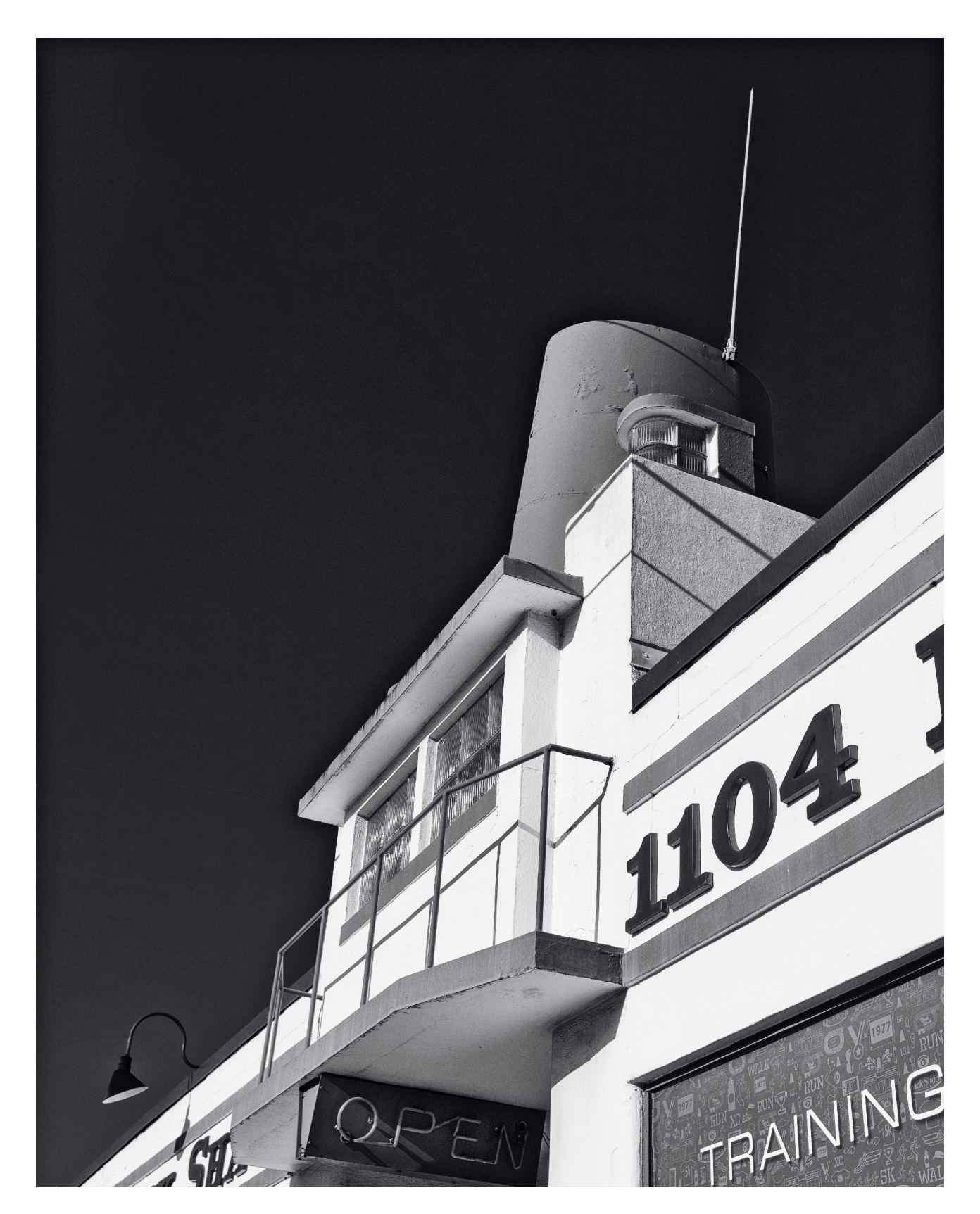
1104 N Mills Avenue • Photo by Bob Egleston Built 1950