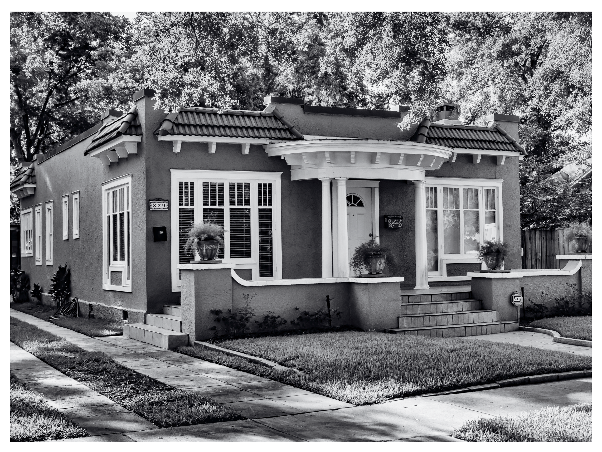
829 N Hyer Avenue Built 1925