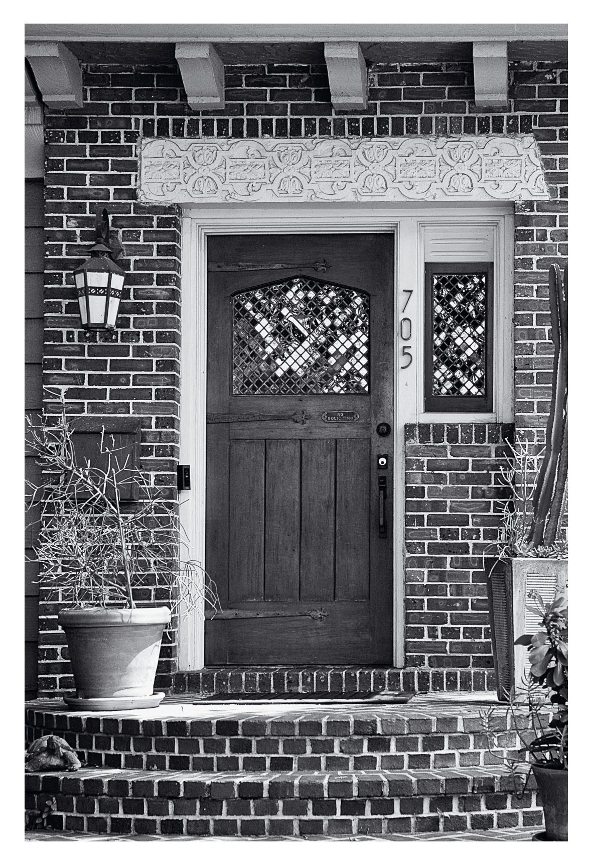
705 Terrace Boulevard Built 1927