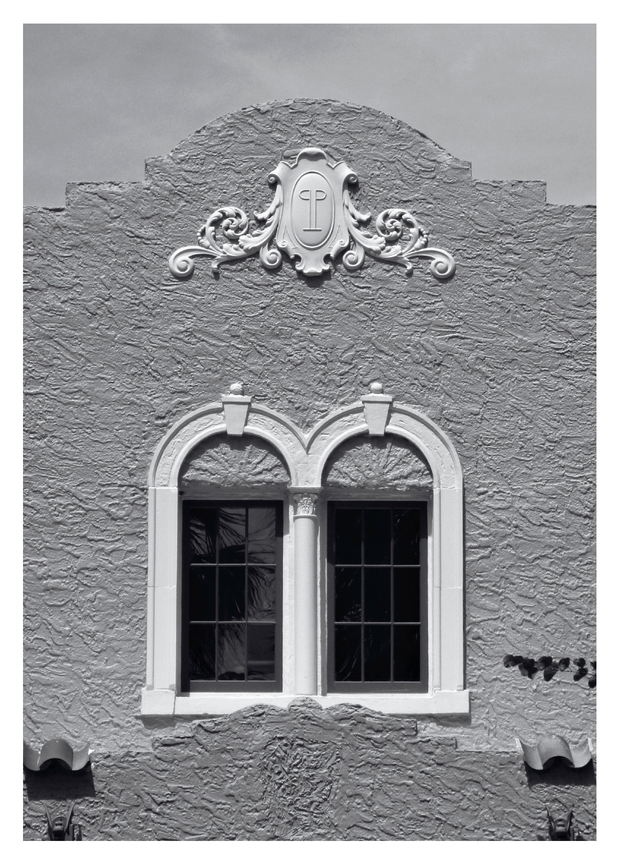
737 Park Lake Circle • Photo by Elaine Person Built 1926