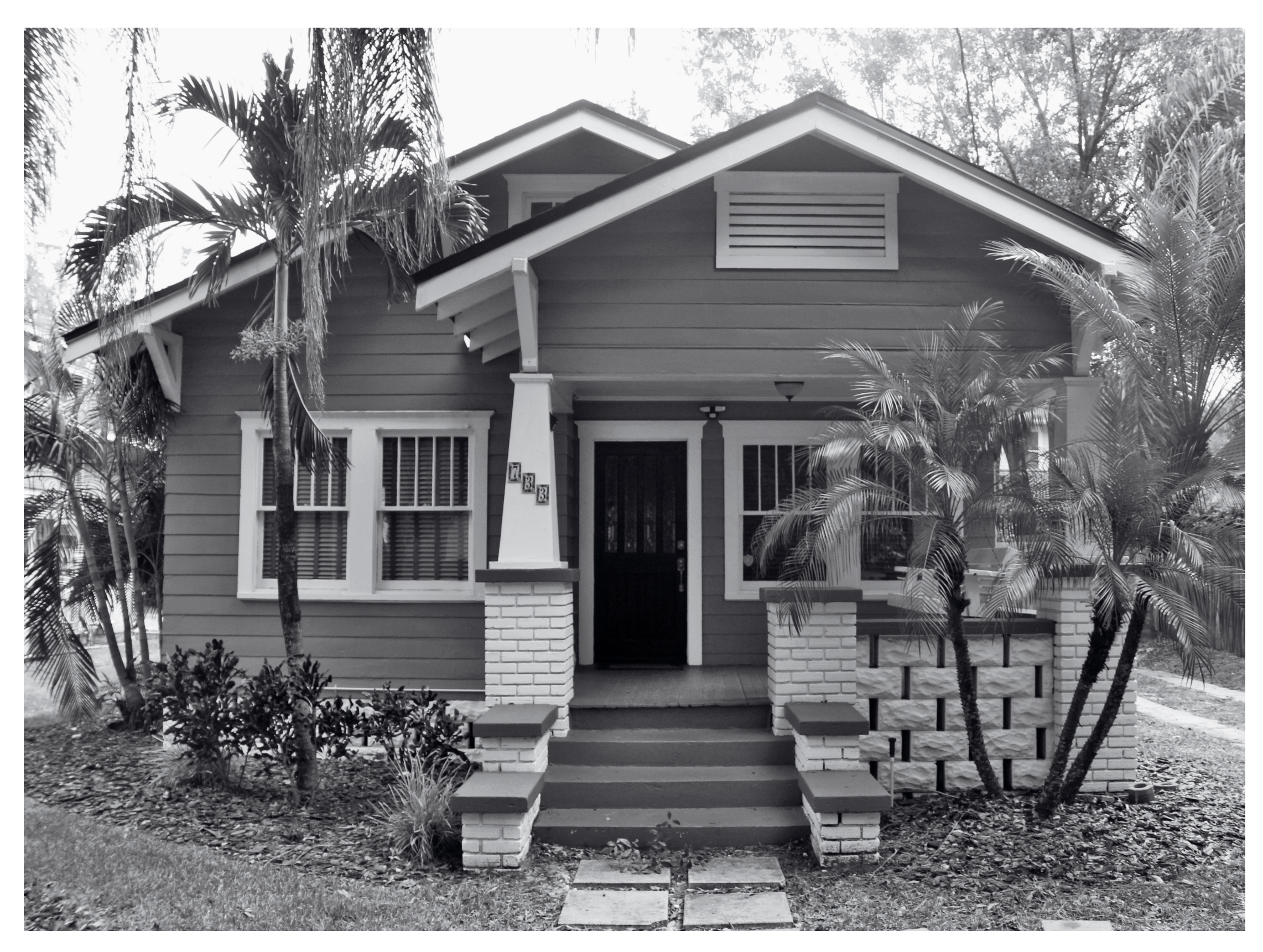
733 N Summerlin Avenue • Photo by Bill Stevens Built 1923